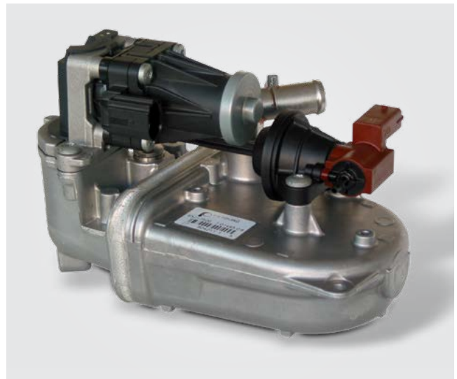
Pierburg EGR cooler module with integrated EGR valve and bypass flap fitted by Fiat and GM