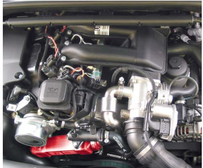
EGR cooler in a BMW 318d (highlighted in red)

The term “nitrogen oxides” is an umbrella term for the gaseous oxides of nitrogen. Use is made of the abbreviation \text{NO}_x , as there are several compounds of nitrogen and oxygen on account of the numerous oxidation stages of nitrogen. Nitrogen oxides irritate and harm the respiratory organs, contribute towards smog and ozone formation and promote the development of acid rain.